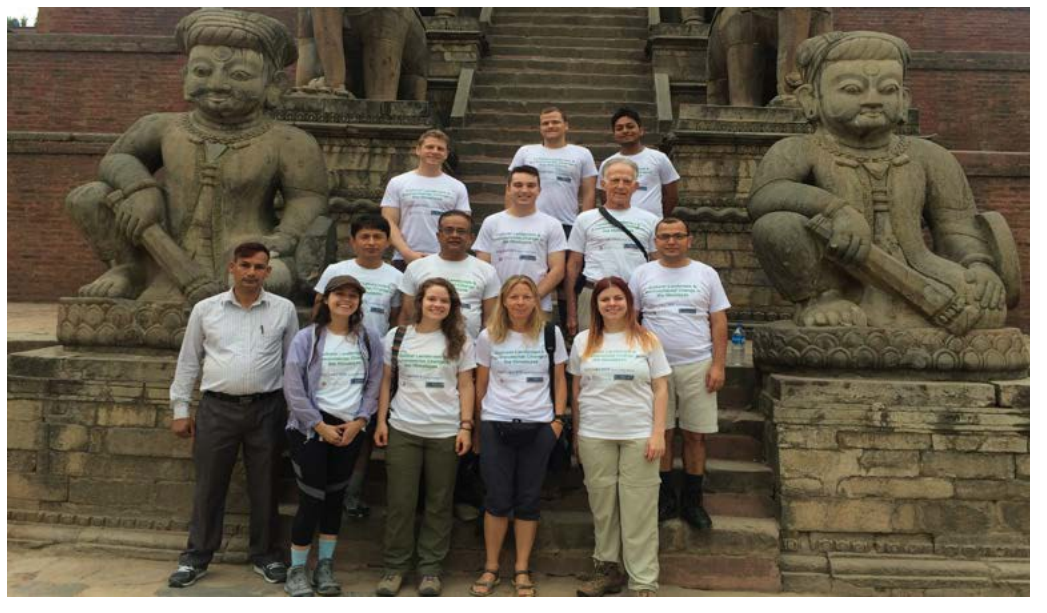
Students and faculty pose at the steps of a Nepalese temple during their study abroad course, GE-OG 177T, Cultural landscape and environmental change in the Himalayas, May 26, 2017. The objective of the course was to experience and observe different aspects of environment, people's livelihood, indigenous practices, and cultural landscape in a high mountain setting.

Pre-Doctoral Scholarship for the 2017-18 academic year. She was one of 76 California State University students who were chosen from 228 applications.